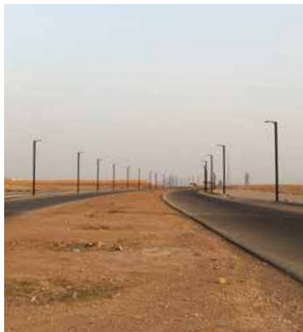
Monopole, Standalone MENA Region