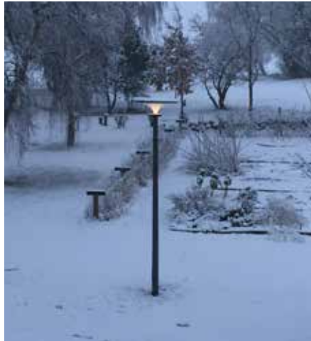
Asima® Sun In cooperation with Lyhne Design, Denmark