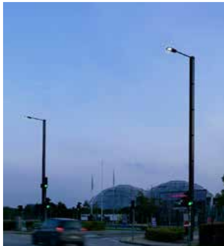
Monopole Randers, Denmark