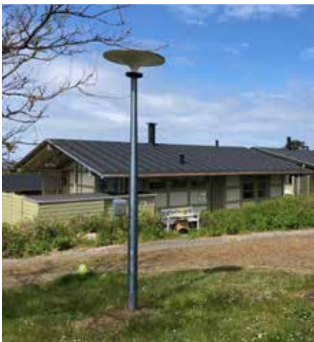
Asima® Sun Located in Gilleleje Ferieby, Denmark