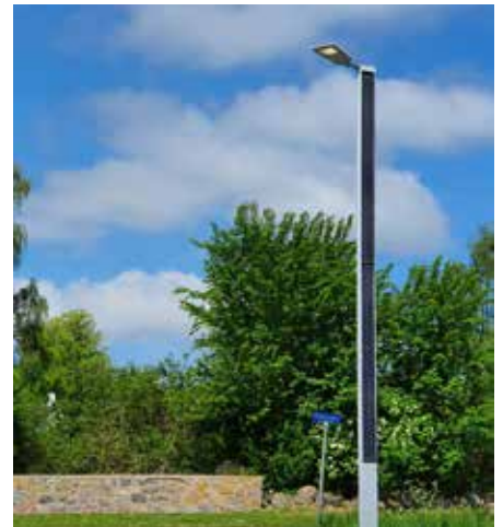
Suncil® Triangular Holbæk, Denmark