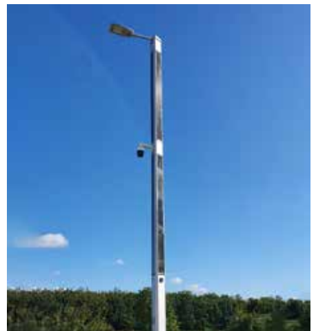
Suncil® Triangular, 8m Randers, Denmark