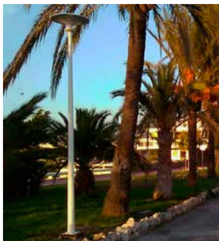
Asima® Sun, Grid Connect In cooperation with Cannes Municipality, France