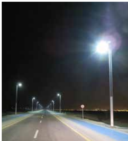
Suncil® Triangular Western region, UAE