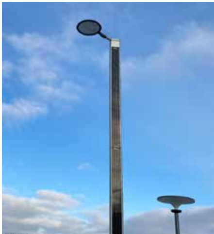
Suncil® Triangular, 6m Randers, Denmark