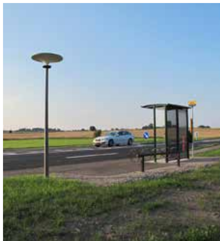
Asima® Sun, Standalone In cooperation with Gribskov Municipality, Denmark