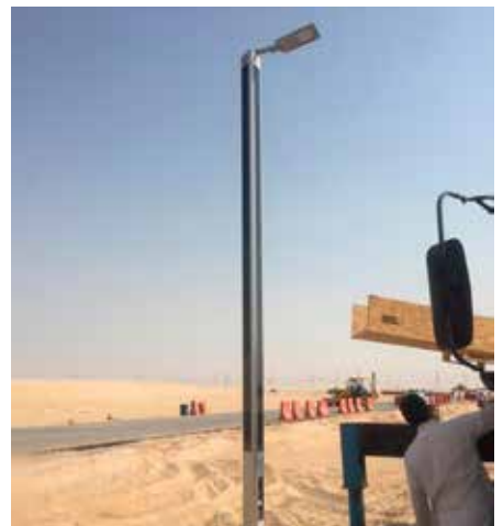
Suncil® Triangular Saudi Arabia