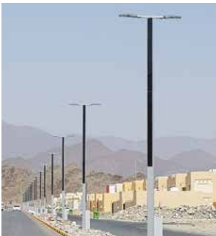
Suncil® Triangular Kalba, UAE