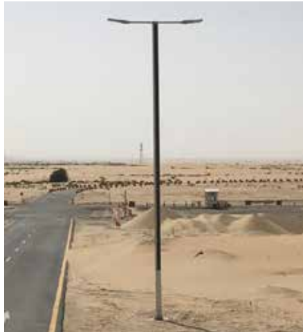
Suncil® Triangular, 12m Dammam, Saudi Arabia