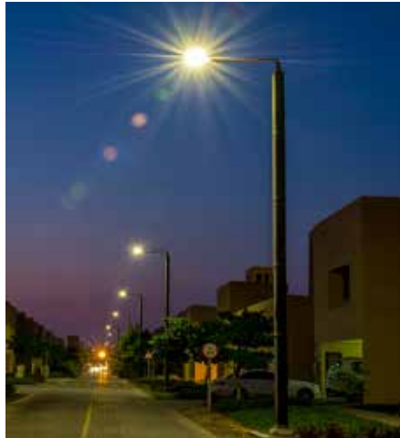
Monopole, Stand Alone In cooperation with Abu Dhabi Municipality, UAE