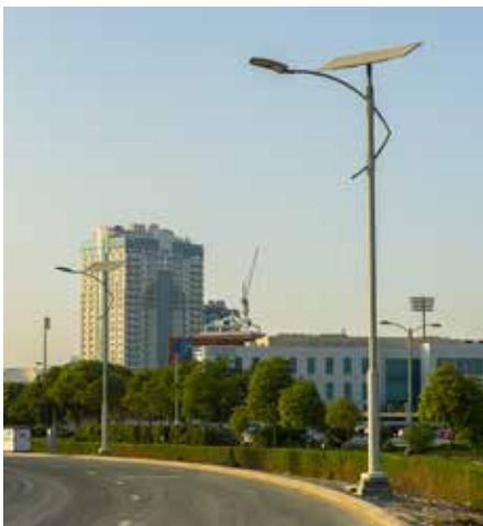
Flatpanel Solution, Stand Alone In cooperation with Dubai, UAE