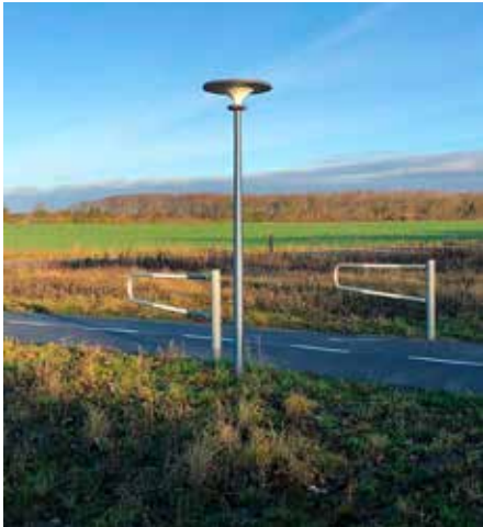
Asima® Sun, Standalone In cooperation with Vesthimmerland, Denmark