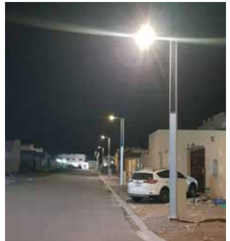
Suncil® Triangular Al Safa villa area,UA