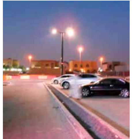
Monopole, Standalone In cooperation with DEWA, UAE