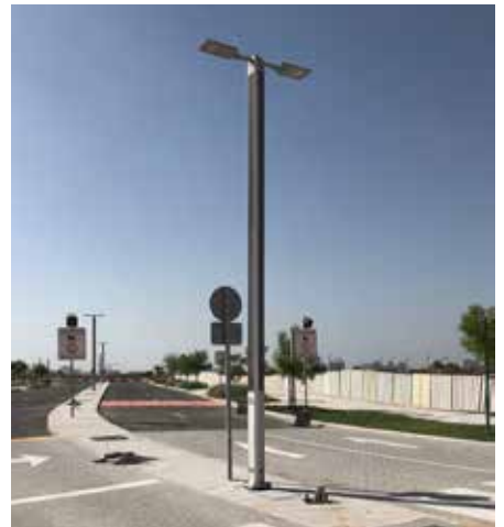
Suncil® Triangular Double arm, lighting up a school road, UAE