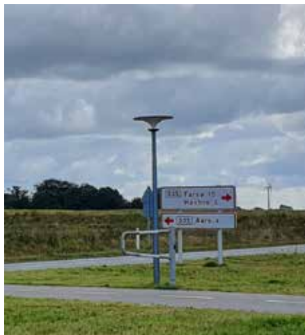
Asima® Sun Aars Municipality, Denmark