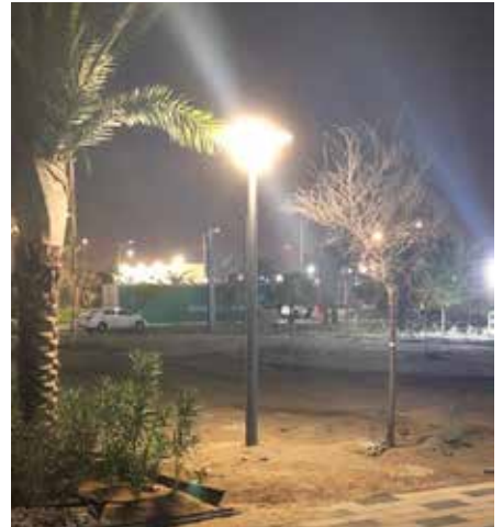
Asima® Sun Abu Dhabi, UAE