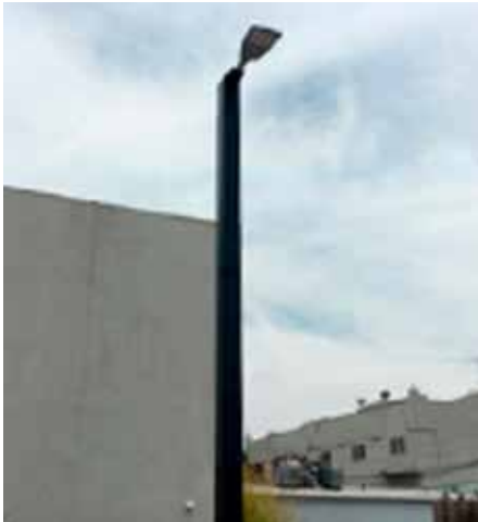
Asima® Sun, Standalone and Monopole In cooperation with Los Angeles Municipality