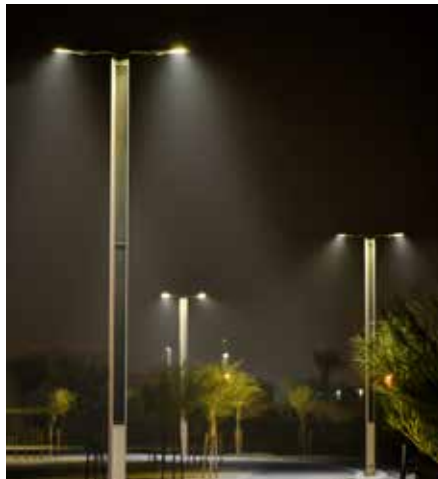
Suncil® Triangular Double arm, lighting up a bike track, UAE