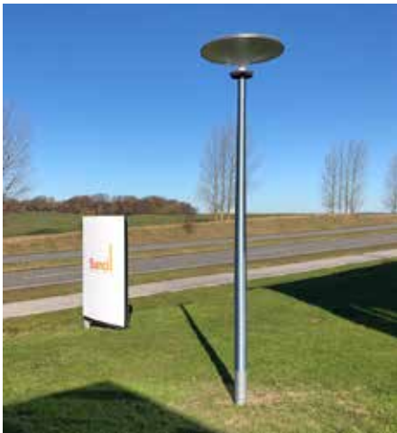
Asima® Sun Located in Egaa, Denmark