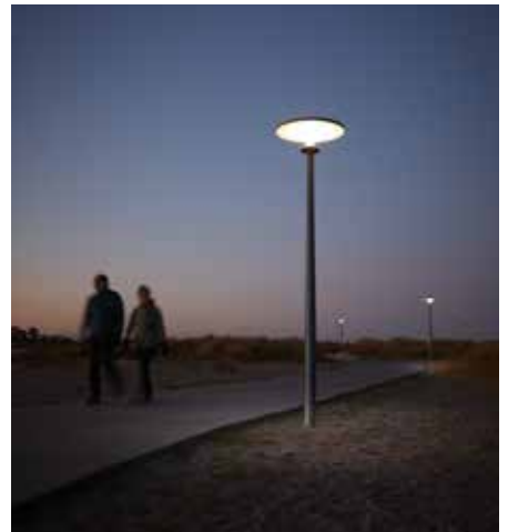
Asima® Sun Amager Strandpark, Copenhagen, Denmark