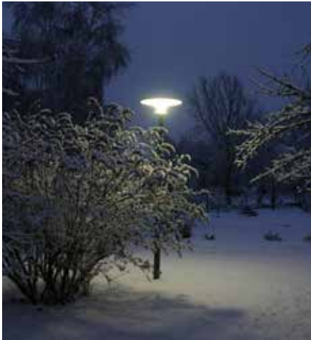
Asima® Sun, Standalone In cooperation with Græsted Municipality, Denmark