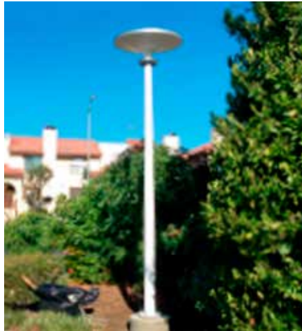
Asima® Sun, Standalone In cooperation with California Homeowners Association