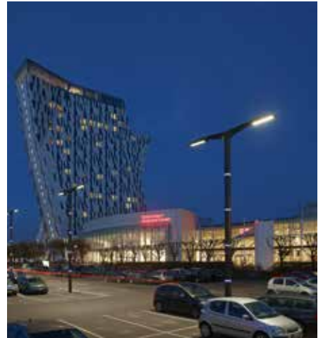
Monopole, Grid Connect In cooperation with Bella Center Copenhagen, Denmark