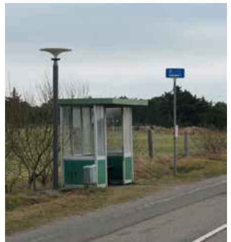
Asima® Sun, Standalone In cooperation with Fanø Municipality, Denmark