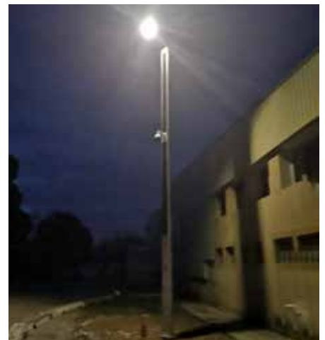
Suncil® Triangular Saint-Remy-de-Provence, France