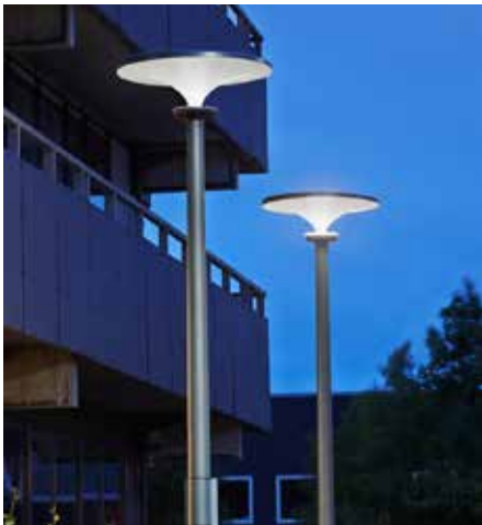
Asima® Sun, Standalone In cooperation with Danish Outdoor Lighting Lab, Denmark