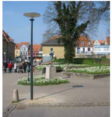
Asima® Sun, Grid Connect In cooperation with Sønderborg Municipality, Denmark