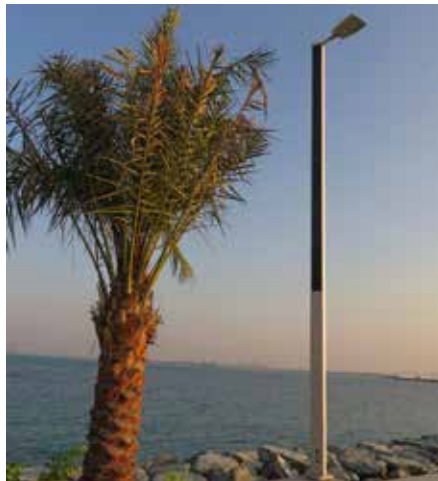
Suncil® Triangular Western region, UAE