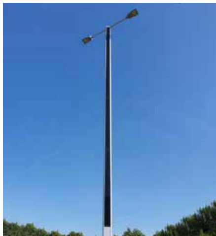
Suncil® Triangular, 12m Randers, Denmark