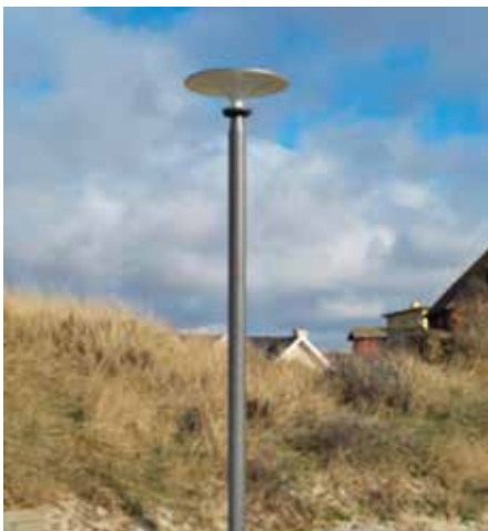
Asima® Sun, Standalone In cooperation with Varde Municipality, Denmark