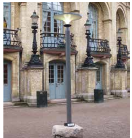
Asima® Sun In cooperation with Landskrona Municipality, Sweden