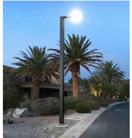
Monopole, Standalone In cooperation with Macdonald Highlands