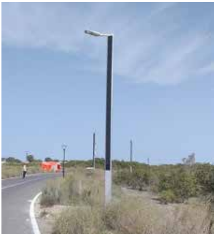
Suncil® Triangular Al-Aryam Island, UAE