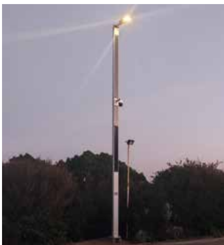
Suncil® Triangular Estela Golf Club, Portugal