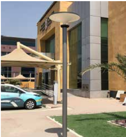
Asima® Sun & Asima® Bollard®, Standalone Fujairah Ministry of Infrastructural Development, UAE