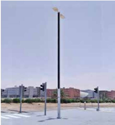
Suncil® Triangular High solar columns for boulevard street, UAE