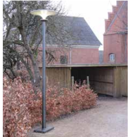
Asima® Sun In cooperation with Tølløse Municipality, Denmark