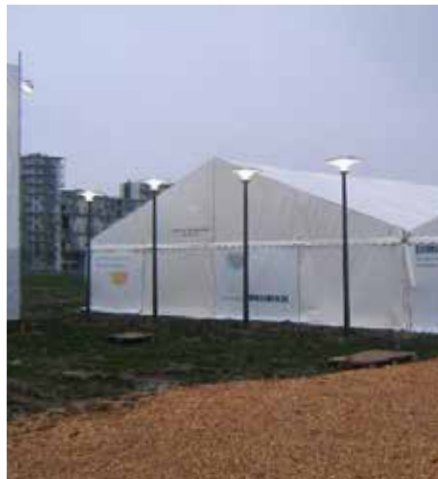
Asima® Sun In cooperation with COP15 Copenhagen, Denmark