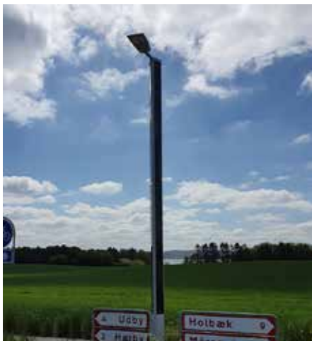
Suncil® Triangular Holbæk, Denmark