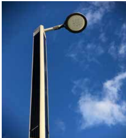
Suncil® Triangular Located in Egaa, Denmark