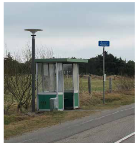
Asima® Sun, Standalone In cooperation with Fanø Municipality, Denmark