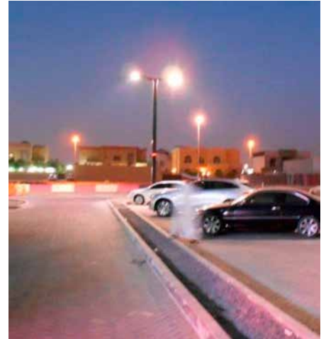
Monopole, Standalone In cooperation with DEWA, UAE