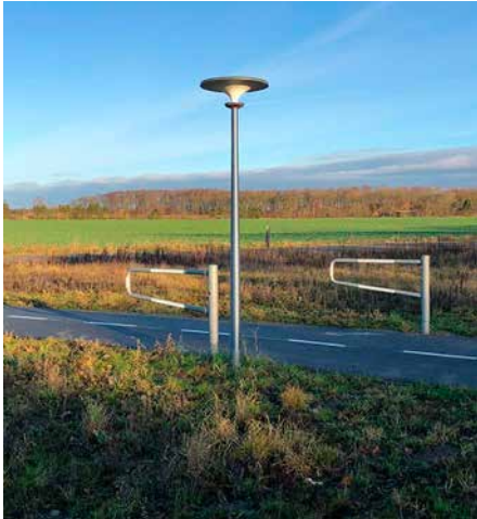
Asima® Sun, Standalone In cooperation with Vesthimmerland, Denmark