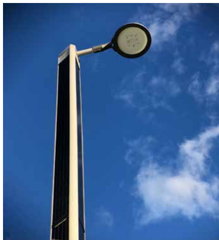
Suncil® Triangular Located in Egaa, Denmark