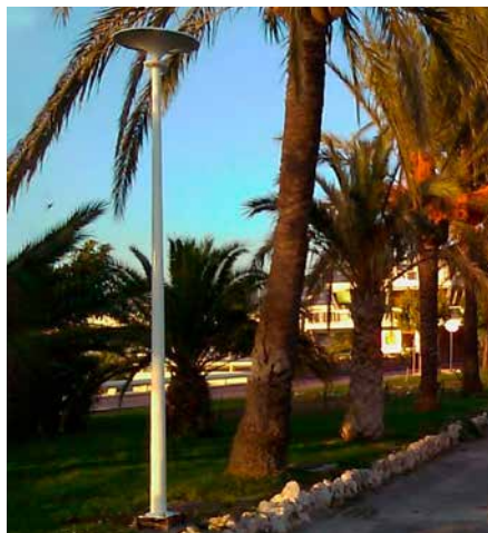
Asima® Sun, Grid Connect In cooperation with Cannes Municipality, France