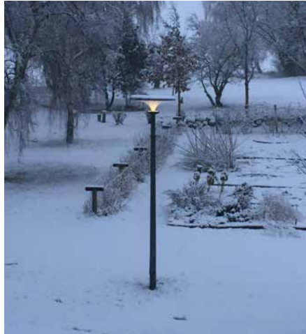
Asima® Sun In cooperation with Lyhne Design, Denmark