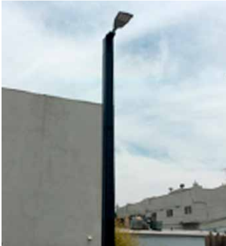
Asima® Sun, Standalone and Monopole In cooperation with Los Angeles Municipality