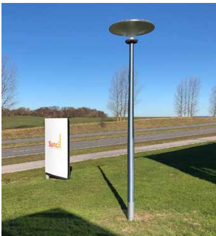
Asima® Sun Located in Egaa, Denmark