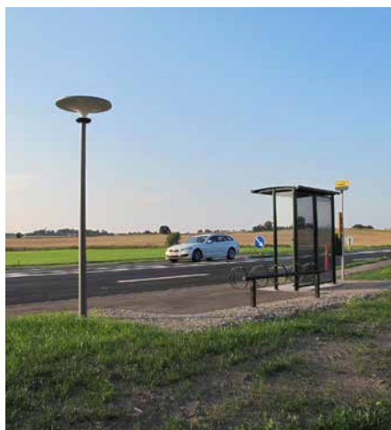
Asima® Sun, Standalone In cooperation with Gribskov Municipality, Denmark