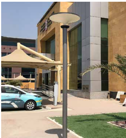
Asima® Sun & Asima® Bollard®, Standalone Fujairah Ministry of Infrastructural Development, UAE