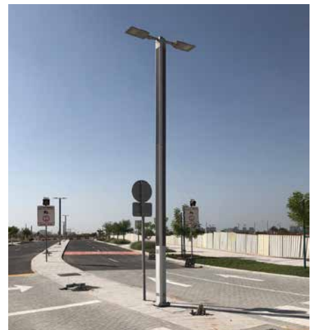
Suncil® Triangular Double arm, lighting up a school road, UAE