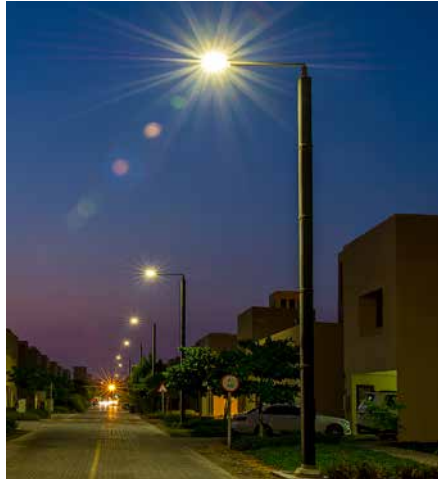
Monopole, Stand Alone In cooperation with Abu Dhabi Municipality, UAE