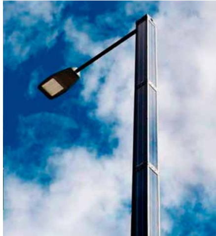
Monopole, Grid Connect In cooperation with Ebeltoft Municipality, Denmark