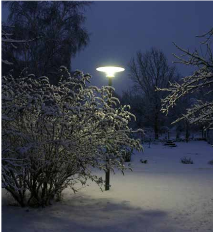
Asima® Sun, Standalone In cooperation with Græsted Municipality, Denmark