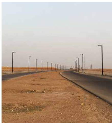
Monopole, Standalone MENA Region