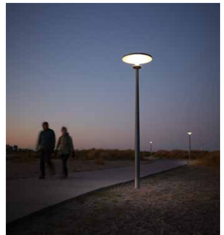
Asima® Sun Amager Strandpark, Copenhagen, Denmark