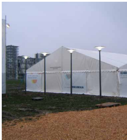
Asima® Sun In cooperation with COP15 Copenhagen, Denmark