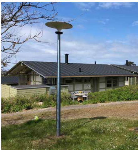
Asima® Sun Located in Gilleleje Ferieby, Denmark