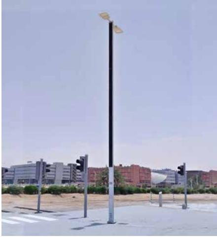
Suncil® Triangular High solar columns for boulevard street, UAE