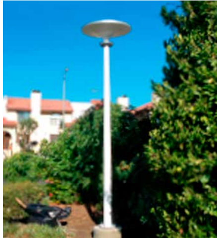
Asima® Sun, Standalone In cooperation with California Homeowners Association