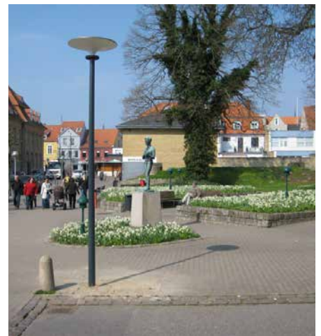
Asima® Sun, Grid Connect In cooperation with Sønderborg Municipality, Denmark