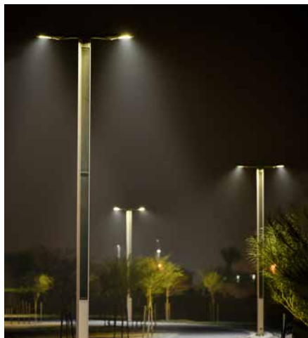
Suncil® Triangular Double arm, lighting up a bike track, UAE