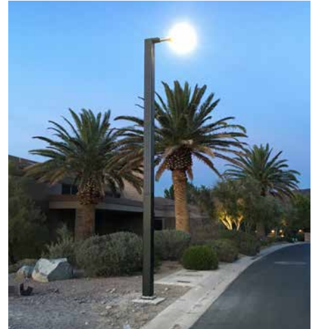
Monopole, Standalone In cooperation with Macdonald Highlands