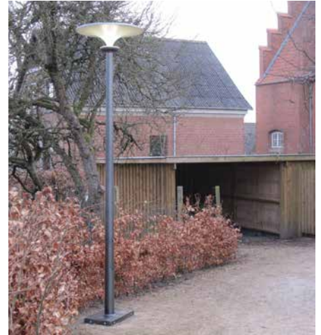
Asima® Sun In cooperation with Tølløse Municipality, Denmark