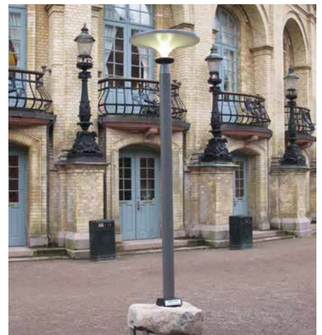
Asima® Sun In cooperation with Landskrona Municipality, Sweden