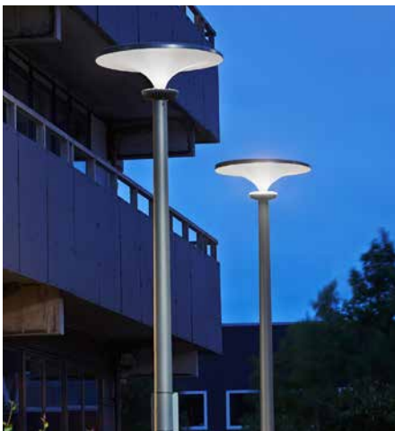
Asima® Sun, Standalone In cooperation with Danish Outdoor Lighting Lab, Denmark