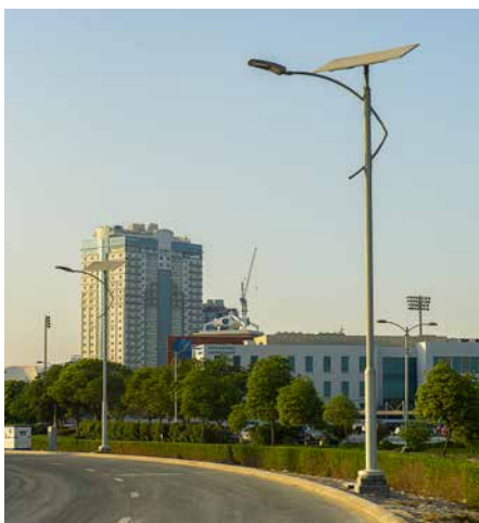
Flatpanel Solution, Stand Alone In cooperation with Dubai, UAE