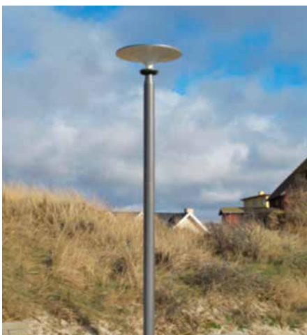
Asima® Sun, Standalone In cooperation with Varde Municipality, Denmark